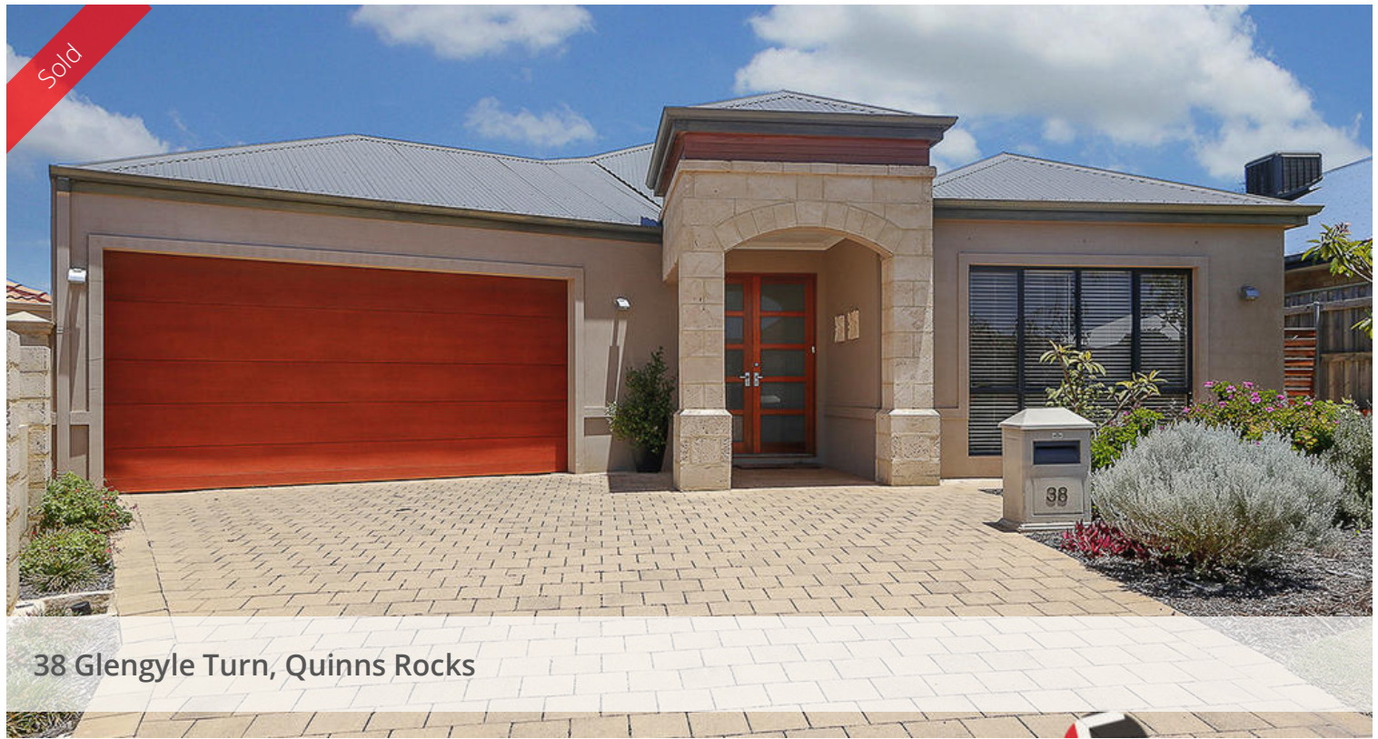
38 Glengyle Turn, Quinns Rocks