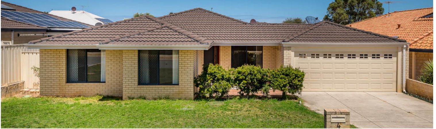
4 Lucca Ent, Pearsall